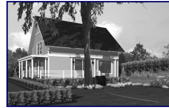
Artist rendering of new rabbi house