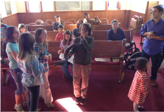
Children practice blowing the Shofar during the Rosh Hashanah children's service.