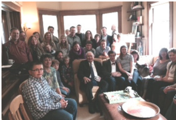
Senator Levin spent a morning last month with our greater Mishpacha!

We hope to provide opportunities for meaningful, personal, and interesting programming focusing on Jewish learning and experiences. We also believe it is crucial to make time to connect as a larger Northern Michigan and Ontario Jewish family of women. (see article on page 1)