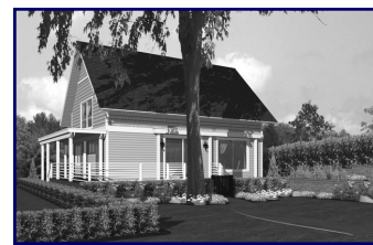
Artist rendering of new rabbi house